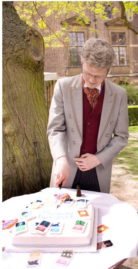
Museums' Fair May 2009. Celebrating the Museum's 125 th and the University's 800 th anniversaries