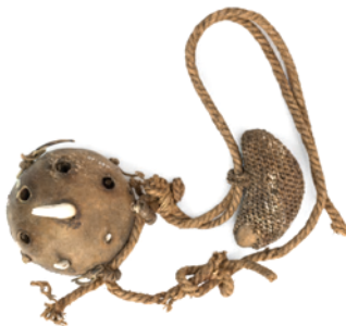
Jjembe. Power object. Baganda People. Donated by Sir Apolo Kagawa. E 1903.473