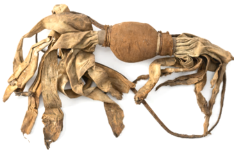
Jjembe. Power object. Baganda People. Donated by Sir Apolo Kagawa. E 1903.476 ,